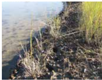
Creek bank dieback at Narragansett Bay, R.I.