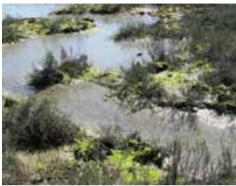
Drowning marsh at low elevations at Elkhorn Slough, Calif.

For millennia, many tidal marshes have persisted by increasing in elevation to keep pace with gradually rising seas. With sea levels projected to increase much faster in the near future than they have in the past, the fate of many marshes—and the benefits they provide—is uncertain.