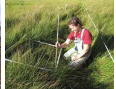
At each Reserve across the System, scientists conduct consistent monitoring of tidal marsh plants, marsh elevation change, sedimentation, and water levels.

● Each circle marks a Research Reserve; green indicates a tidal marsh resilience study site.